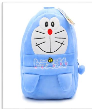
Image 2. Bag

For the naughty student, the teacher only show many pictures while mention the pictures because she is very interested in seeing a picture only. To avoid boring